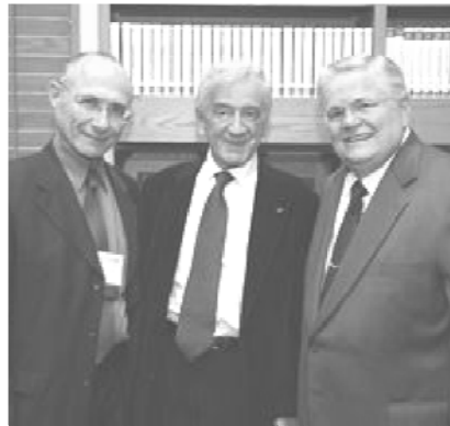
Israeli minister Uzi Landau, Wiesel and Hagee

"... this man is a disgrace to humanity. [...] This man is the No. 1 Holocaust denier in the world. This man publicly, repeatedly says