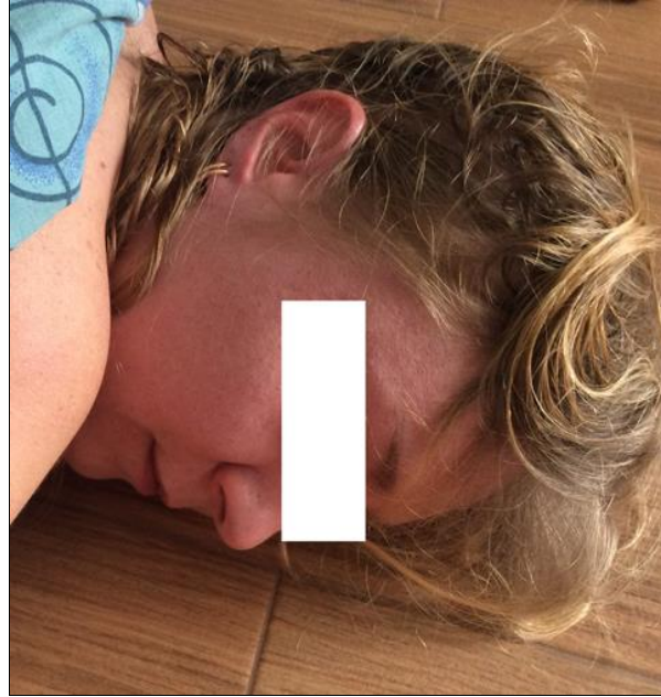
My pink, unconscious roommate (in color online)

Even opening windows on opposite sides of the apartment did little to disperse the gas. Opening the door on the third side of the apartment did the trick. The two real, lifesaving clothing-delousing gas chambers in Majdanek which had heaters / blowers attached to a wall in the middle of them, with doors on opposite ends in them likely served the same purpose my apartment's third side door did. The operatives likely turned the heater / blower on after a gassing in addition to opening the opposite doors in order to disperse the gas quickly and entirely. In the absence of a ventilation fan, hoping for a simple cross