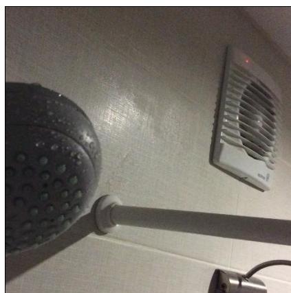
Ventilation fan in my bathroom ... better than what is said to have been installed in most of the alleged Nazi gas chambers.

Examining in particular eyewitness testimony, it’s clear the symptoms described are impossible, simply not in the least consistent with real carbon-monoxide (or cyanide) poisoning. The victims