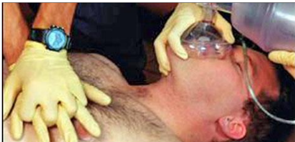
Resuscitation of a pinkish CO-poisoning victim (in color online)

Of course anyone designing a real "gas chamber" would be aware of these ventilation problems, which mocks the claim that the smaller gas chamber at Majdanek, which, absent the obviously post-war Soviet created hole in the ceiling, only had one door to ventilate the room, is far from something the