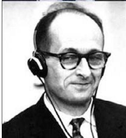
Heiko Maas (top) and his doppelgänger Adolf Eichmann (bottom) No scope for misplaced tolerance...

German consumers from too much tolerance since 17 December 2013 when he became minister. He is a leader in the Sozialdemokratische Partei Deutschlands .