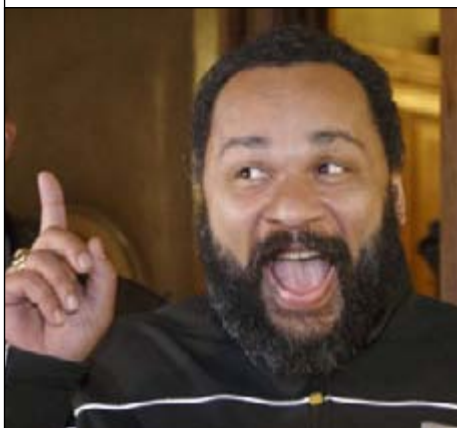
Dieudonné M’Bala M’Bala

The problem is that M’Bala M’Bala is black (his father is from Cameroon). A black man challenging Holocaust Belief undercuts the claim that Revisionism is “racist.” Even worse, Dieudonné’s growing audiences consisted mainly of young disenfranchised Blacks and Arabs/French.