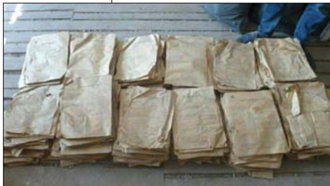
These documents, devoid of any real meaning, are the focus of yet another Holocaust sensationalism.

The report, which lacks a display or translation (the forms would have been in Hungarian) of the subject forms, and much less a tabulation of their aggregated contents, speculates as to the uses the information might have been put to in conducting or extending the Holocaust, the while reciting widespread accounts of deportations of Jews from (other parts of) Hungary, and the death toll said to have been experienced by the Jews of Hungary during World War II. It does not mention Jewish