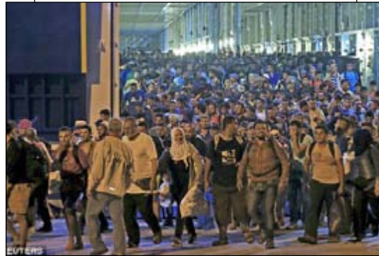
Migrants arriving in Germany. A witness: "Half an hour ago on the border between Italy and Austria I saw a huge crowd of immigrants.

Of course, there's a great deal of pork to cut on this lumbering sow—the first problem to arise is simply where to start. Günter Grass has resoundingly pointed the way to start by merely citing undeniable moral imperatives ( goo.gl/22FE4g ); it's conceivable that progress has already been attained on this front.