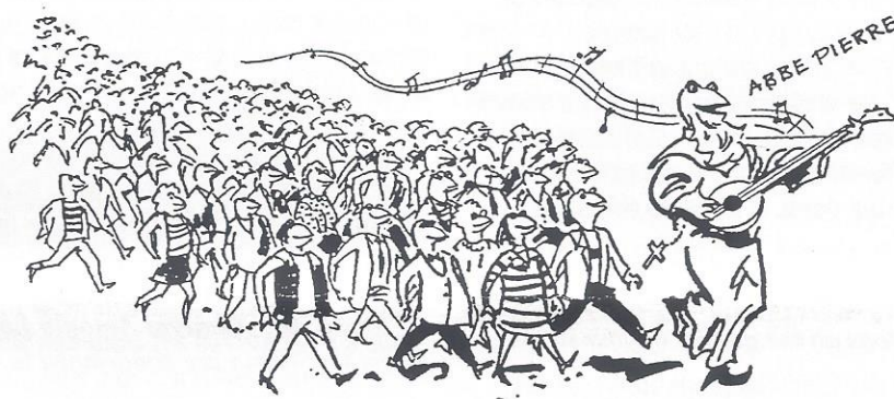
The siren song of Abbe Pierre.