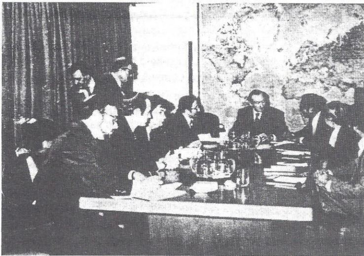
Simon Wiesenthal Rabbis Cosy Up With "Nazi War Criminal"